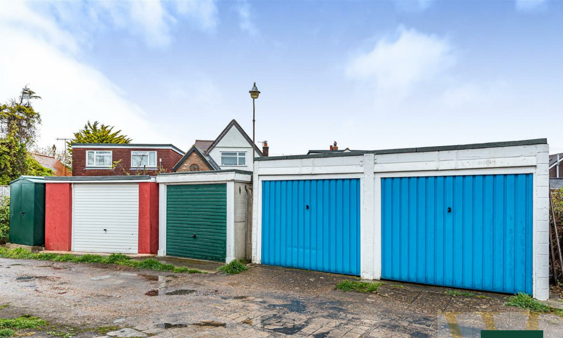
Garages at Rear 158, Old Shoreham Road | | Shoreham-By-Sea BN14 5TF